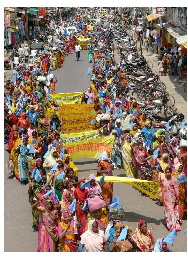
FIGURE 2 Massive rally in Khandwa, MP on Jun 4 2007 by Omkareshwar and Indira Sagar dam affected

And cynicism needs to be continually checked through creating space for engaging more passionately with normative and philosophical ethics.