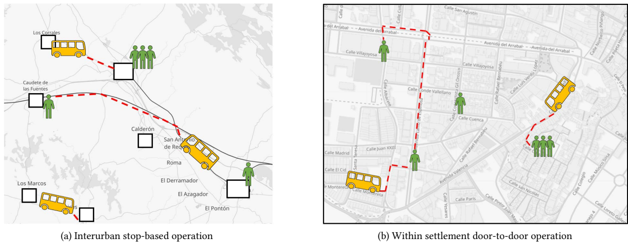
Fig. 2. Graphic representations of demand-responsive transportation systems operating with different configurations. Passenger demand is depicted by green human icons, whereas vehicles are portrayed by yellow buses. Vehicle routes are indicated with red dashed lines. Picture (a) reproduces an interurban operation, where settlements, indicated with white boxes, act as stops to travel from/to. Picture (b) depicts a door-to-door operation within a rural settlements, in which passengers can ask for a ride from any location within the town.

of Misano Adriatico, Italy. The performance of the service is evaluated through a selection of financial, operational, environmental, and social key performance indicators. The results of the analysis revealed a reduction in kilometers traveled, fuel consumption, and air pollutants, together with an increase in the area covered by the service, an increase in potential daily deliveries (for freight transport), and an increase in the occupancy rates of vehicles (for passengers).