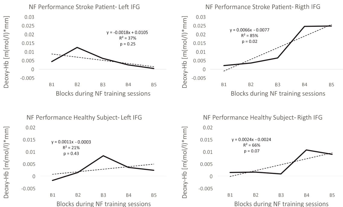
Figure 1: Neurofeedback performance of the stroke patient (upper panel) and the healthy control subject (lower panel). Depicted are changes in deoxy-Hb over the five blocks (B1-B5) within one training session averaged across all 4 NF training sessions and the results of the regression analysis.

Both subjects were able to linearly increase deoxy-Hb over the right IFG, while deoxy-Hb over the left IFG did not change significantly during NF training (Fig. 1). During the offline pre-assessment, the stroke patient showed a stronger NIRS signal change when executing swallowing movements over the right IFG (affected hemisphere) compared to the left IFG, while the healthy control subject showed a bilateral activation pattern over the IFG during the execution task (Fig. 2). After the NF training, both subjects showed a bilateral NIRS activation pattern during active swallowing (Fig. 2).