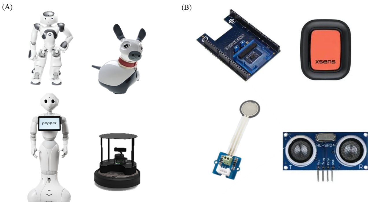
Figure 1. (A) Social assistive robots. From left to right: NAO, MiRo-E, Pepper, and TurtleBot. (B) Monitoring technologies presented to the participants before the discussion. From left to right: light detection and ranging, Xsens, pressure sensor, and ultrasonic sensors.

Xsens. The presentation aimed to equip participants with sufficient information to offer coherent suggestions on the topic and provide a more tangible understanding of the current capabilities of SARs and monitoring technologies. The presentations typically lasted between 20 and 30 minutes in total. This segment was followed by the focus group discussion, which took the form of a semistructured interview. Participants were asked about challenges they face in their daily activities, how SARs and monitoring technologies could assist them in reducing sedentary behavior and in daily activities, and their suggestions and concerns regarding the use of SARs and monitoring technologies in the home. The discussions were audio recorded and then transcribed verbatim. The focus groups typically lasted approximately 90 minutes (range 83-101 minutes) with a 15-minute break.