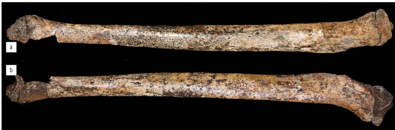
Figure 2: Patterns of mineral staining affecting tibia U.W. 101-1070. Note differential mineral staining patterns between conjoined fragments at the distal end.

In addition to lichen, Thackeray suggests 1(p.5) that snails and beetles could indicate the presence of leaf litter (on which they feed), which would be found near the cave entrance and therefore in a situation with diffuse light. However, as noted by Dirks and colleagues 13 , snails have been recognised to colonise dark caves to considerable depth 17 , and are far from restricted in diet to just plant matter 18 . Gullella sp. and Euonyma varia (Connolly, 1910) occur in large numbers in the Rising Star Cave system, including in deep chambers in the dark zone, and may well be responsible for some of the bone surface modifications on the fossils. Subulinid snails (including Euonyma ) are largely omnivorous and are thus not dependent on green plant material as a food source (Herbert D 2016, personal communication, January 28), while Gullella spp. are carnivorous and feed mostly on other snails. 18