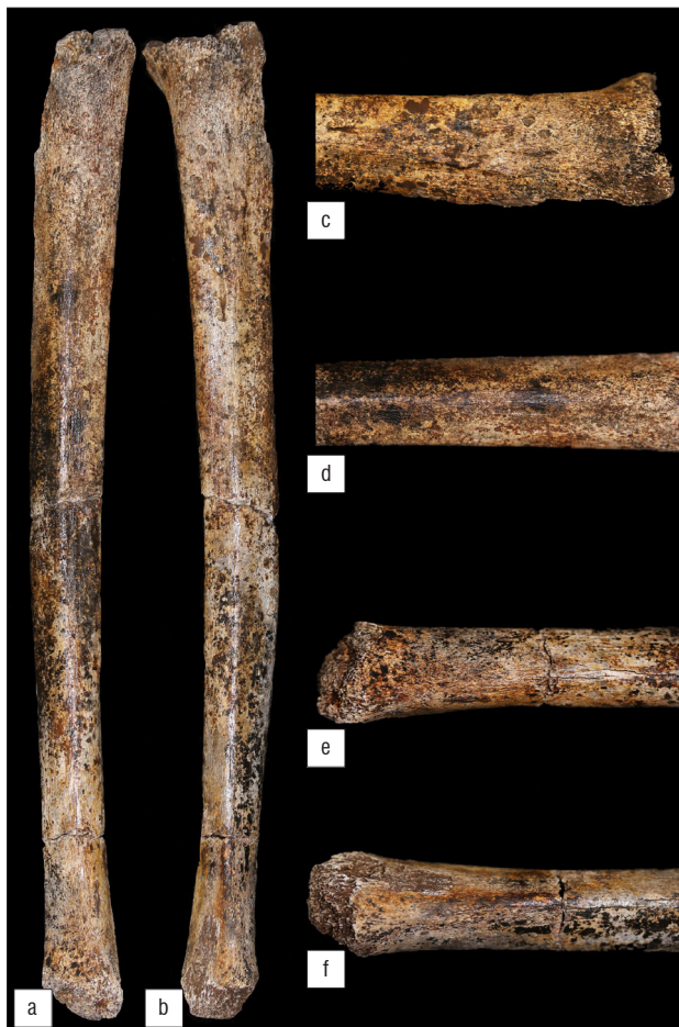
(a) Medial aspect; (b) lateral aspect; (c) close-up of anterior shaft; (d) mid shaft; (e) close-up of distal end seen in (a); (f) close-up of distal end seen in (b).

However, the distribution of Mn staining is not only on this one side of the specimen, but on all anatomical sides (anterior, posterior, medial and lateral), as shown in Figure 1. Such a distribution can also be seen on many specimens (for example, in Figure 2, specimen U.W. 101-1070, correctly attributed here). The distribution of Mn staining on the Dinaledi Chamber material is generally circumferential, occurring on multiple sides of bones. That distribution is not compatible with lichen growth in the present context, and there are significant reasons to reject the hypothesis that the Dinaledi Chamber is a secondary deposit. 2,13