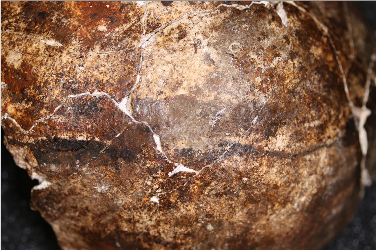
Figure 3: Specimen U.W. 101–419 Cranium A(1) displaying tide lines of mineral staining which extends across different vault fragments. Tide lines mark a contact boundary between the bone surface and surrounding sediment, and indicate the resting orientation of the bone during precipitation of the stains.

Thus the notion that snails are light-dwelling, leaf-litter feeders is incorrect, and bone surface modification by snails cannot be used to imply a close entrance to the surface or redeposition of the hominin fossil material from a location near light. Furthermore, much of the radula damage observed on the bones of H. naledi occurs after they were mineralised – therefore most invertebrate damage was probably produced inside the dark Dinaledi Chamber on bones already covered in coatings of manganese and iron oxide deposits (Figure 4).