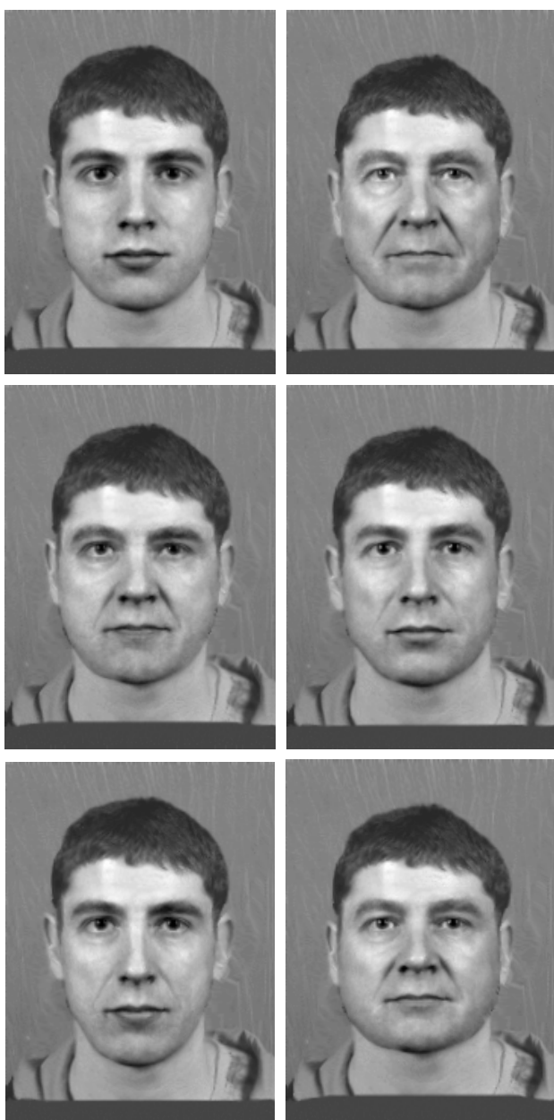
Figure 2. Example holistic transforms. From left to right, top to bottom: reduced age, increased age; reduced health, increased health; and reduced weight, increased weight.

Twelve of the faces used for the model were selected at random and manipulated by a fixed amount in both the positive and negative direction along each dimension. The amount of change was taken as twice the vector length for each dimension, as this produced a sizeable change that was not too extreme: very large changes tended to produce unacceptable distortions. Example transforms can be seen in Fig. 2.