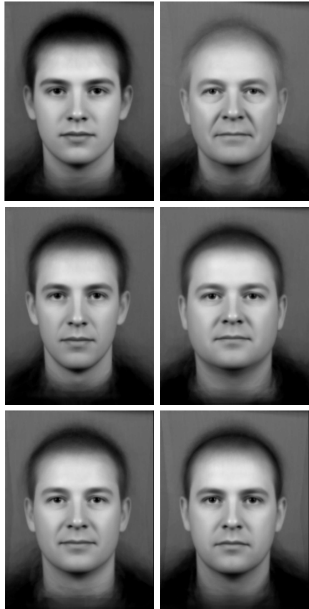
Figure 1. Example averages of the holistic dimensions for age (top row), facial weight (middle row), and threatening (bottom row).

various holistic vectors. To make a face appear more youthful, for example, the coefficients of a face would be progressed along the aging vector in the direction of the average young face.