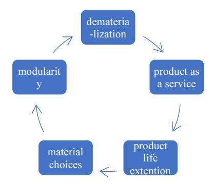
Figure 2. Design Strategy in ESG context

By refining the design strategy of this suitcase with distinct ESG attributes (as illustrated in Figure 2), it was discovered that in this sustainable design endeavor, particularly the collaborative process, the modularity of product design thinking serves as the foundation. Designers can select materials based on distinct modules. For instance, although the performance of PC materials recycled by Costron from NONGFU Spring may not be as good as the original PC or PCR materials (such as cleanliness, particle size, and other standards), these "non-standard" features can also become a distinctive form of travel suitcases that caters to the novel and specific needs of its target customers. In this way the recycling approach itself is not the key problem.