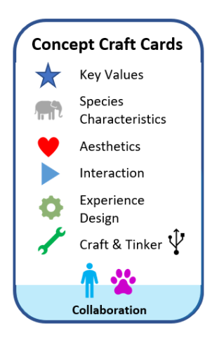
Figure 1: Key Card showing contents of deck with relevant icons