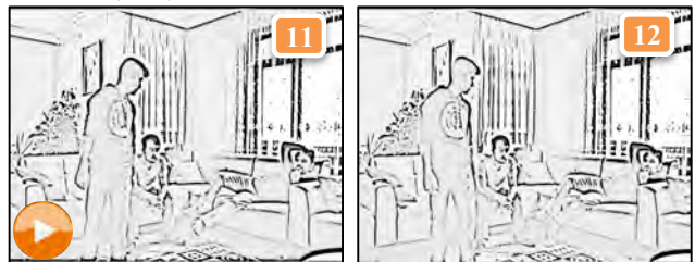
Fragment 4: Reflecting on play

01 *(1.6)+ (2.8) pl *>>steps forwards, prepares for bowl -> sp1 +>>sits down+ 02 SP1 yürüyerek atınca when you throw while walking 03 biraz daha sanki şey it is a bit like 04 hız[lı gidiyo it is as if it goes faster 05 SP2 [hızlı gidiyo öyle it goes faster like that 06 (0.3)* *(0.2) pl ->* *bowls -> 07 SP2 şu enerji*yi felan varsa that energy and so if available pl ->* 08 SP2 onu kullanırıyor it makes you use that 09 (1.8) 10 SP1 s[s:- 11 SP2 [øhatta %şu *bov%ling hareketi var ya actually you know that bowling movement sp2 øgazes towards pl -> sp2 %,,,,,,,%moves feet -> pl *gazes towards sp2 -> 12 SP2 a#yak # hareketi% the foot movement sp2 ->% fig #fig.11 #fig.12 13 SP2 onu* yaøparsan daha da şey if you do it it is even greater pl ->* sp2 ->∞ 14 (1.2)