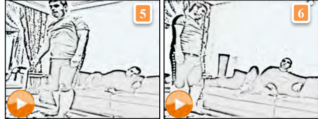
Fragment 2a: Spectator ‘leaning in’ to troubleshoot play

sp ->+ pl *turns towards sp -> fig #fig.6 05 SP o dengeyi* nasıl sağlıcaz how will we maintain that balance pl ->* 06 (0.4) 07 PL ortaya kendisi şeyapiyo it is doing itself towards the centre 08 ayarı kendisi veriyo it is adjusting itself