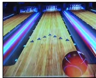
Figure 4: Triangular indicators in-game

Here we join two friends playing bowling together (PL and SP). Our fragment is divided into two parts, showing the first and second of two consecutive bowls by the current player. To perform a successful bowl, the player must adjust their bodily position and arm swing using an indicator on-screen that shows the coordination of the throw and therefore future trajectory of the ball (Figure 4).