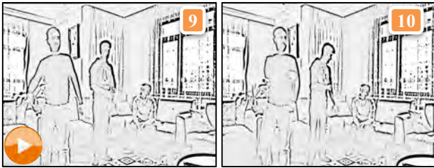
Fragment 3: A spectator complimenting a player

01 (0.8) 02 *(1.8)* pl1 *hits the ball* 03 (0.3) 04 $(1.3)$ pl2 $fails to return the ball$ 05 (0.7) 06 SP bayağ +sert vuruyon # haa: you are hitting quite powerfully sp +gazes towards pl1 -> fig #fig.9 07 top gi*derken # bile +ses *şey yapıyo even while the ball moves it is making a sound pl1 * gazes towards sp * sp ->+ fig #fig.10 08 PL1 vururum kan[*ka I hit it mate pl1 *serves for next game -> 09 SP [iyice ayıktın sen duruma you really have understood the situation 10 (0.7)* (1.1) pl1 ->*