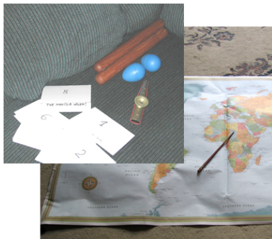
Figure 2. . Question cards, kazoo, egg shakers and clave sticks, and paper mapgame

In the second session we looked for the same concepts as in session one – understanding of sound intensity exhibited through children’s physical trajectories over the map. In addition, we looked at the way children themselves performed intensity (in terms of scaling, polarity, and mapping to trajectory). Through audio analysis we examined and coded the temporal and dynamic patterns of the sound feedback children provided for their game partner. This helped reveal their understanding of how continuous intensity-based feedback mapped against a progress gradient of a task.