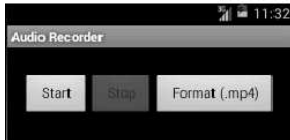
Fig. 2: Code snippets and graphical interface of the Recorder app

1 public class Recorder extends Activity { 2 private MediaRecorder recorder = null; 3 .... 4 public void onCreate(...) { 5 ((Button) findViewById(Start)) 6 .setOnClickListener(startClick); 7 .... 8 // startRecording(); 9 } 10 11 private void startRecording() { 12 recorder = new MediaRecorder(); 13 recorder.setAudioSource 14 (MediaRecorder.AudioSource.MIC); 15 recorder.setOutputFile(/* file name */); 16 .... 17 recorder.start(); 18 } 19 20 private View.OnClickListener startClick 21 = new View.OnClickListener() { 22 public void onClick(View v) { 23 .... 24 startRecording(); 25 }}; 26 .... 27 }