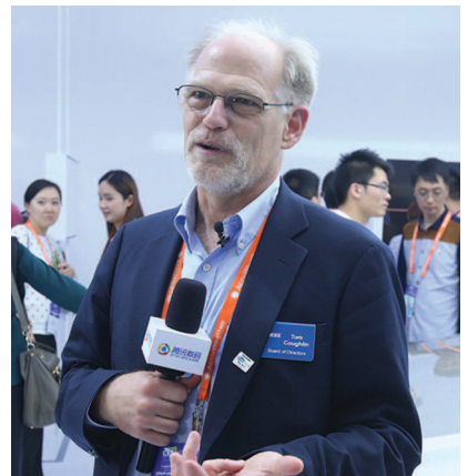
Tom Coughlin at CES Asia 2015.