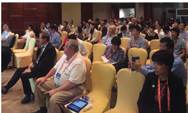
Attendees listening to one of the many speeches at ICCE-Asia 2015.