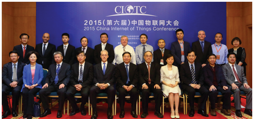
A VIP group photo at the Sixth China IoT Conference and Expo.

Digital Object Identifier 10.1109/MCE.2015.2462495 Date of publication: 29 October 2015