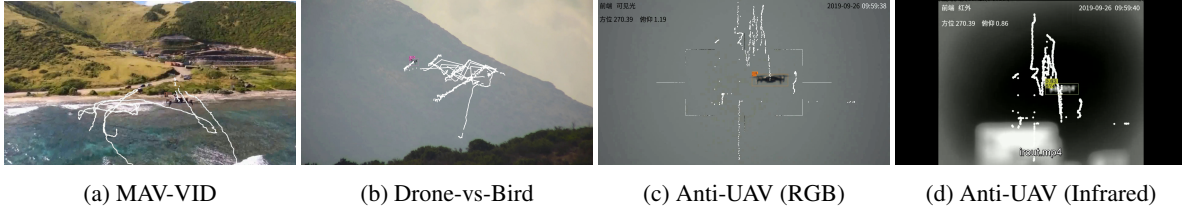
Figure 3: Examples from each dataset of visualization of drone position history