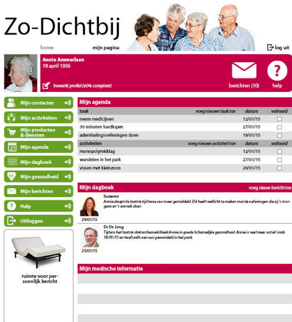
Figure 2. Prototype of the Care plan “Zo-Dichtbij” from Annie (for the Dutch market).

this research. Using familiar patterns when designing a prototype helps potential users to feel more acquainted with the artifact. This is also applicable for the consistency in the navigation and other elements of the interface. Preparing a clickable interactive model for a usability test is a much smaller effort compared to the one when a fully functional artifact is provided, however the effects of testing can be comparable. Although the participants of the usability test were not provided with a full experience, the test was designed in such a way that it evaluated critical elements of the artifact based on the tasks and goals given to the participant creating the feeling a finalized artifact. Therefore, the approach taken in this iteration for the evaluation of the design of the platform is suggested for next iterations. Based on the input extracted from the first usability test the mock-ups are translated in a prototype of the platform for the Dutch market. See Figure 2.