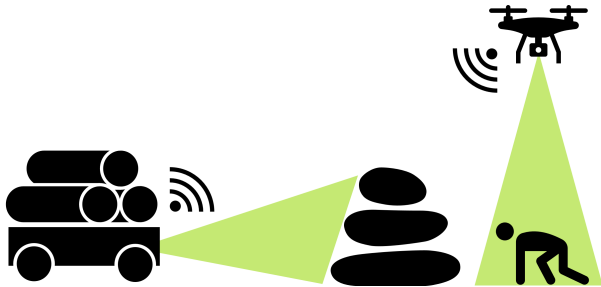
Fig. 2. Use case description (minimalistic): The collaborative drone allows for an additional point of view to eliminate occlusions caused by terrain obstacles.

both the interconnectedness and autonomy of collaborative systems are being investigated. These risk assessment methods should integrate risk assessment strategies from standards belonging to different related domains, including machinery safety (ISO 13849 [11] and ISO 12100 [12]), automotive safety (ISO 21448 [13]), and cybersecurity (IEC 62443 [14] and ISO/SAE 21434 [15]), adapting them to address specific challenges within the forestry domain.