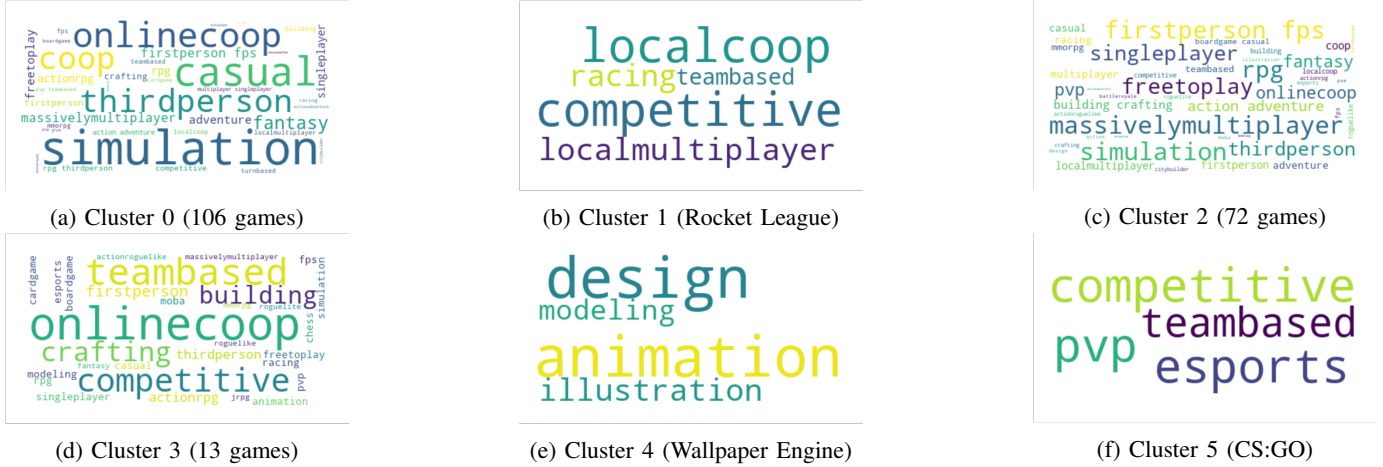
Fig. 2: Word clouds for the 5 game clusters, displaying the frequency of the user-defined tags in Steam.

highest. The games in the cluster present a centralized structure , in terms of degree. The nodes, on average, present a high degree distribution but very variable ( mean = 60 , and std = 145 ).