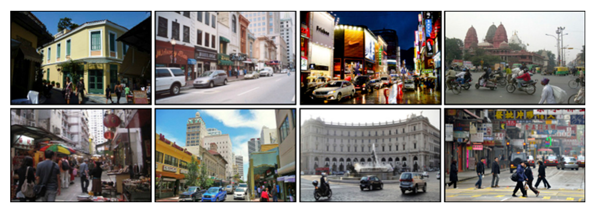
Fig. 1. Urban street scenes. Top row shows Athens, Baltimore, Busan, and Delhi. Bottom row shows Hong Kong, Miami, Rome, and Shanghai. ( Top, Left to Right , second from Left ) Images modified with permission from Doug Dawson (Photographer), Wikimedia Commons/Carey Ciuro, Wikimedia Commons/McKay Savage. ( Bottom, Left to Right ) Images modified with permission from Wikimedia Commons/Jmschws, Wikimedia Commons/Marc Averette, Zaid Mahomedy (Photographer), Wikimedia Commons/Michael Elleray.

Fig. 2. Questions are posed sequentially to the computer vision system, using a "query language" that is defined in terms of an allowable set of predicates. The interpretation of the questions is unambiguous and does not require any natural language processing. The core of the VTT is an automatic "query generator" that is learned from annotated images and produces a sequence of binary questions for any given "test" image I_0 \in \mathcal{I} whose answers are "unpredictable" (Statistical Formulation). In loose terms, this means that hearing the first k-1 questions and their true answers for I_0 without actually seeing I_0 provides no information about the likely answer to the next question. To prepare for the test, designers of the vision systems would be provided with the database used to train the query generator as well as the full vocabulary and set of possible questions and would have to provide an interface for answering questions. One simple measure of performance is the average number of correct responses over multiple runs with different test images.